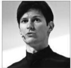
Durov's arrest has caused outrage in Russia, with some govt officials calling it politically motivated

FRENCH PROSECUTORS ON Wednesday freed Telegram CEO Pavel Durov from police custody after four days of questioning over allegations that the messaging app is being used for illegal activities. Durov was detained on Saturday at Le Bourget airport outside Paris as part of a judicial inquiry opened last month involving 12 alleged criminal violations. "An investigating judge has ended Pavel Durov's police custody and will have him brought to court for a first appearance and a possible indictment," a statement from the Paris prosecutor's office said. Allegations against the Russia-born Durov, who is a French