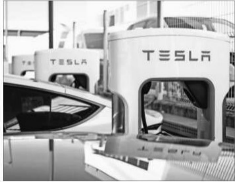
A Tesla EV Supercharger station in the Fuenlabrada district of Madrid, Spain, on February 28, 2024.

But more than 12 months later, Tesla's network, with nearly 30,000 fast-charging plugs in the United States and Canada, remains largely inaccessible to most people who don't drive Teslas because of software delays and hardware shortages. The delays have fueled speculation that Musk was having second thoughts about opening up Tesla's network, possibly because he was worried that access would help other automakers sell battery-powered models and lure customers from Tesla, which has suffered from declining sales. Tesla eased those fears a bit on Friday when the company's charging unit posted on X that it had stepped up production of a crucial piece of hardware: adapters that drivers of Ford, Rivian and other car brands need to connect to Tesla chargers. A Tesla factory in Buffalo is producing 8,000 of the adapters per week, the company said, noting that outside suppliers are also producing the part. Still, it is unclear how fast those adapters would reach electric vehicle owners. Tesla did not respond to a request for comment, and the other automakers have been